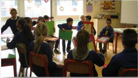
My personal universe