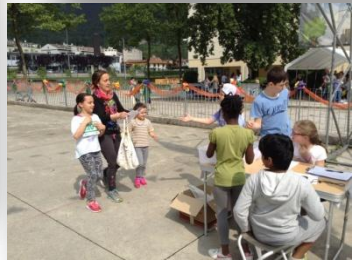
Taking responsibility - Recycling orienteering