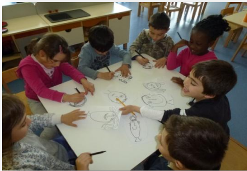
My portrait - Nursery school