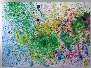
A bubble of madness bursts in my body which reminds me of a never-ending game