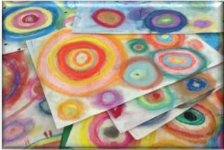
My Soul Bird opens the drawer of happiness and everything lights up into thousands of bright colours