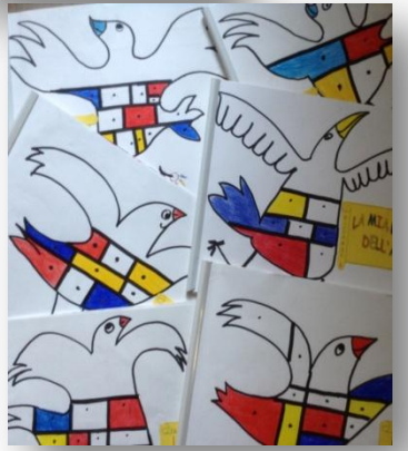
My feelings – My soul bird