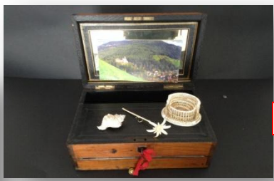
Me in a box