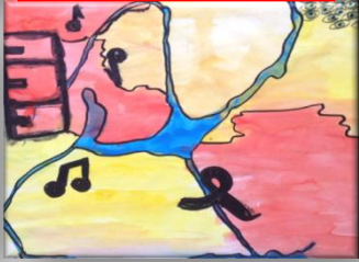
Anxiety overwhelms me, wraps me, it expands and it dominates me